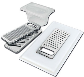
Graters kit with ring-holder and food collection tray 8159 101 * only in combination with the accessory 8644 101