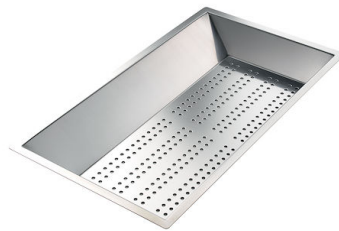
Stainless steel perforated tray 8151 000 * only in combination with the accessory 8644 101