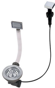
Automatic waste fitting - PM