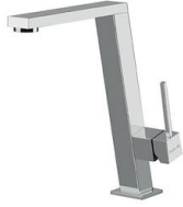
Mixer Tap Master 8493 000